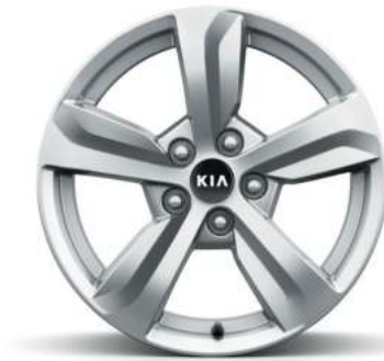
17" ALLOY LX Diesel