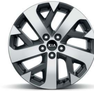
18" ALLOY EX Diesel