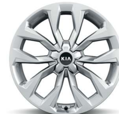
20" ALLOY Premium Diesel