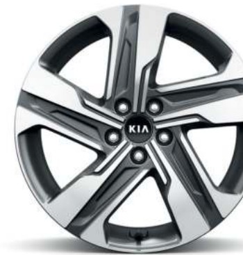
19" ALLOY Hybrid 2WD Premium Hybrid AWD Premium Plug-in Hybrid AWD Premium Deluxe Diesel