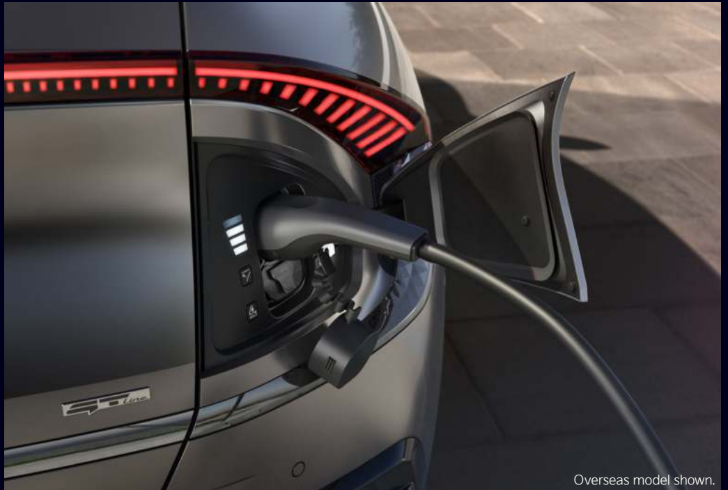
Overseas model shown.