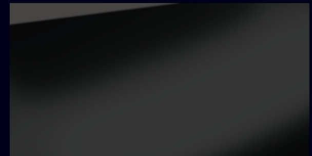
Aurora Black Pearl

Colour swatches are indicative only, vehicle body colours may appear different in person.