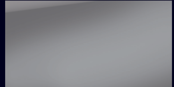
Moonscape Matte (Premium paint charge applies - $1,450 incl. GST)