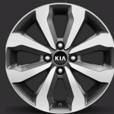
16" Alloy (EX)