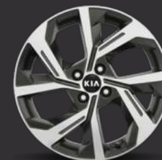
17" Alloy (GT Line / GT Line+)