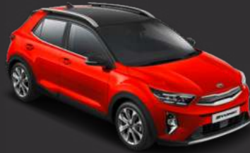
SIGNAL RED / BLACK ROOF