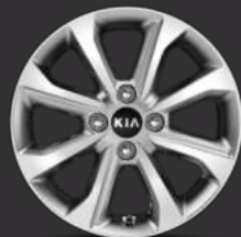
15" Alloy (LX)