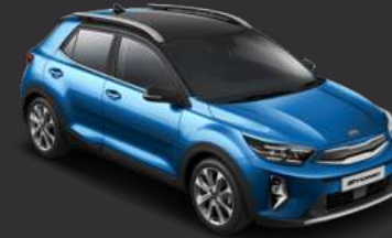
SPORTY BLUE / BLACK ROOF