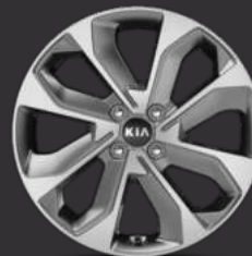
17" Alloy (Limited)