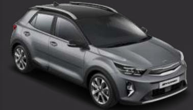
PERENNIAL GREY / BLACK ROOF