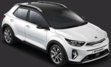
CLEAR WHITE / BLACK ROOF