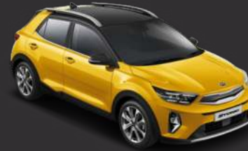
MIGHTY YELLOW / BLACK ROOF