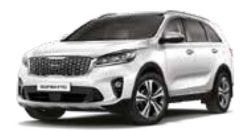
Clear White (SX only)