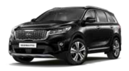
Aurora Black Pearl