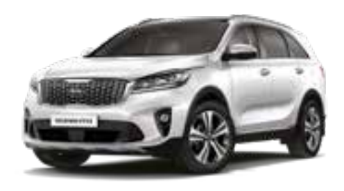
Snow White Pearl (GT Line & GT Line Premium only)