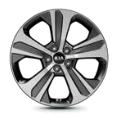
19" Alloy wheel