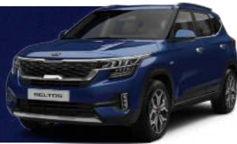
Dark Ocean Blue