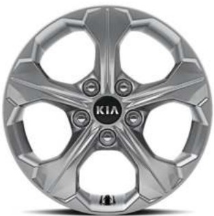
16" Alloy (LX & LX Plus)