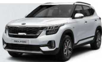
Snow White Pearl