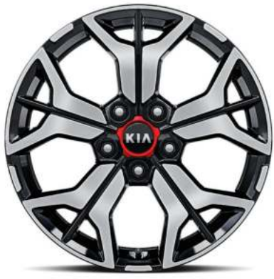
18" Alloy (Limited & Limited AWD)

Two-tone colours are available at additional cost.