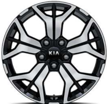
17" Alloy (EX)